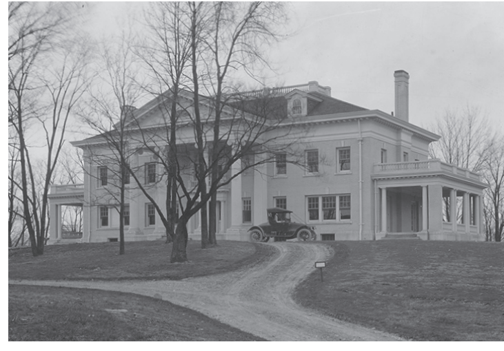
Hawthorn Hill circa 1914

In addition to the house tour, docents will be available