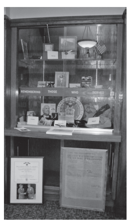
Remembering Those Who Served