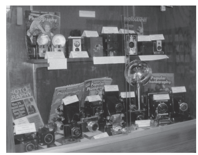
Vintage Camera Collection