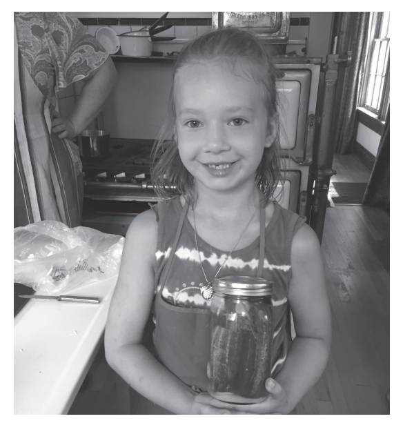
Bread and Butter pickle canning education program