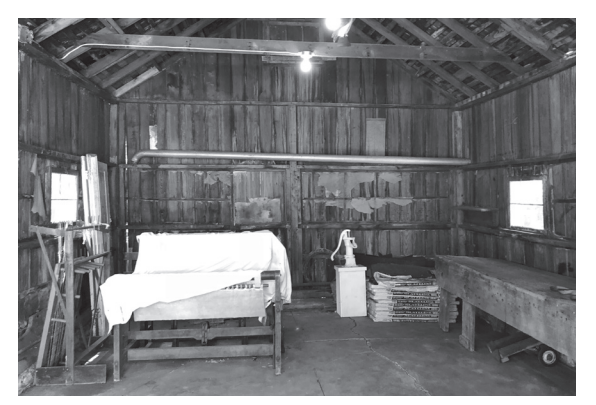
Debris was removed from the carriage house making ready for structural repairs

• 150 years of dirt from the 1920's basement floor was carried out in 15 five-gallon buckets. The basement was thoroughly cleaned, and storage shelves were added.