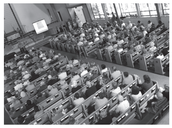
The Far Hills Speaker Series moved to a larger venue due to the program's increased popularity

The Far Hills Speaker Series In its sixth year, the Far Hills Speaker Series continues to inform and entertain. In collaboration with Wright Library, the Society sponsored lectures on a variety of interesting topics, presented to