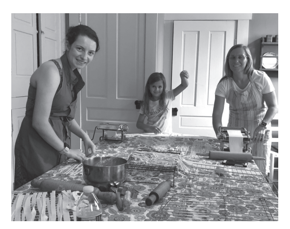
Pasta and Pesto Homemade at the Homestead education program