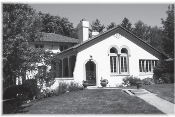
Spanish Eclectic Style

Spanish-inspired architecture reached its zenith in the 1920s and 1930s, but the design can still be found applied to contemporary homes today.