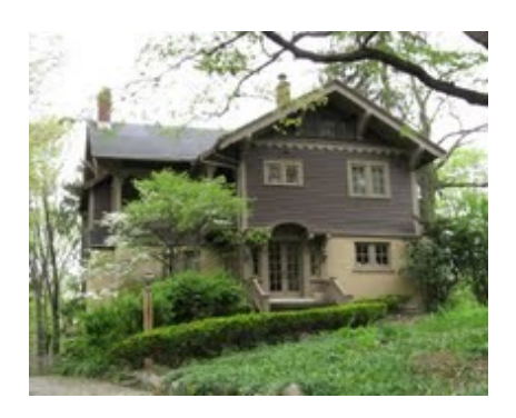
Examples of Craftsman-influenced houses found in Oakwood. On the left, a substantial Louis Lott-designed bungalow exhibits stone columns and chimney. On the right, roof brackets and other detailing exemplify the Craftsman style.