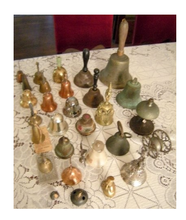
Ethel's Bell Collection