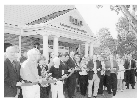
Dedication of new building on Far Hills. Lebanon Citizens National Bank Lobby has historical pictures of Oakwood from our archives.