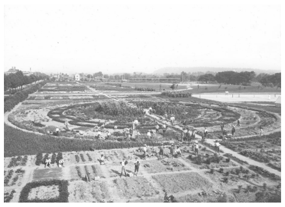
Olmstead designed gardens for young boys

The garden program was designed to improve the boys' behavior and the surrounding neighborhood, but the boys didn't always become model children. In 1902, roughly fifty boys were expelled from the program throughout the summer. The gardens operated on a demerit system, and the boys were expected to work on school holidays and the entire summer break. The instructor issued demerits for absences, neglecting crops, rule infractions, and in extreme cases expelled the boy. In 1903, the ten winners all had at least one demerit