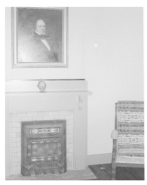
West interior wall of central dining room (original house) showing Rookwood fireplace

What does this transformation involve? It means stripping old wallpaper, washing down bare plaster walls, repairing those plaster walls, determining the most appropriate depiction of that room, and then choosing the right wall color or wallpaper and trim paint. Then begins the real work...the work of restoring the room: painting walls and ceiling, wallpapering, cleaning floors, painting trim, finding the right furnishings and placing them in ways that would have been typical for the room and the way the room was used and then finding the right decorative items that complete the look. All of this requires literally hundreds of volunteer hours, under the direction of board member and local artist Phyllis Niemeyer Miller, and becomes a labor of love for those involved as it quickly consumes all free time.