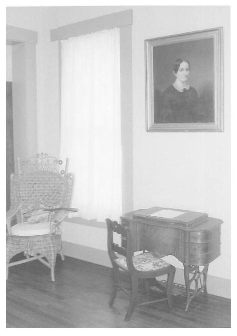
South wall of central dining room (original house)

Who benefits? Everyone! The school children who visit The Homestead as part of their curriculum on local history and the visitors who wish to learn more about Oakwood's history but also the large social history of America as it moved from a rural to a suburban culture....all come to understand what it meant to live in the years between 1865 and 1920. This is the unique story that The Homestead tells...and it is the story The Oakwood Historical Society wants to tell in more complete detail in time for Oakwood's centennial celebration next year.