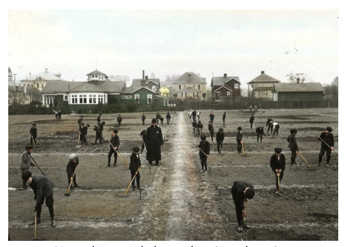
Young boys work the gardens in early spring

The NCR Boys' Gardens was the first corporate sponsored garden program, and progressive reformers regarded it as the largest and most complete garden program in the United States.