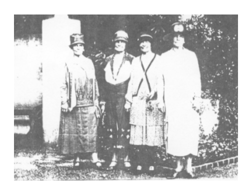
An early photograph of Garden Club of Dayton members during the late 1920s.

Special educational article by Mackensie Whittmer