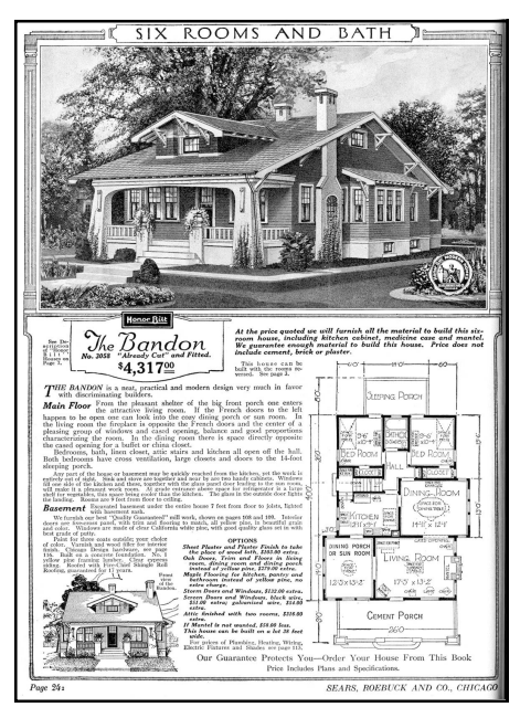
An example of a Sears Pattern Book home illustration from the early 1900s.

Between 1890 and 1930 more houses were erected in our nation than ever before. This rapid growth of suburban areas also defined a new style of mass-produced architecture. These sub urban neighborhoods were trying to connect the rural landscape and "American way of life" within an urban setting. The houses had to appear spacious with large lots, but in reality, to maximize the limited space along the streetcar lines, the lots and houses were very modest. Sears and Aladdin sales catalogs rarely showed a house along a developed streetscape. Instead, they depicted a single house on a lot with no neighboring houses, illustrating two elevations and surrounded by greenery. Architects created houses with wraparound porches, front and rear porches, side entries, and wraparound sidewalks. All these elements evoke the sense of a spacious lot and not the